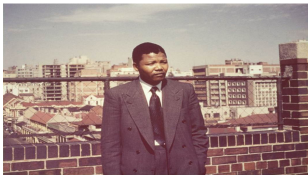
Figure 1: Nelson Mandela on the roof of Kholvad House in 1953.